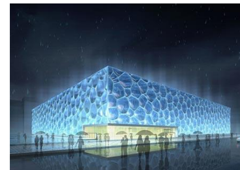
Water Cube Olympic