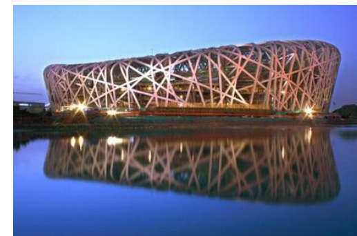
National Stadium--natural "Bird's Nest"